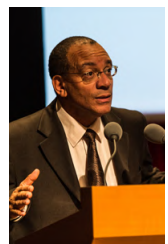
Pr Patrick Plaisance

Special adviser for the Minister of Internal Affairs