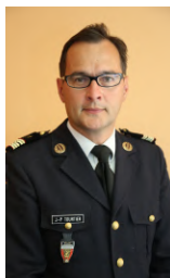
Pr Jean-Pierre Tourtier

National medical adviser for the French Red Cross